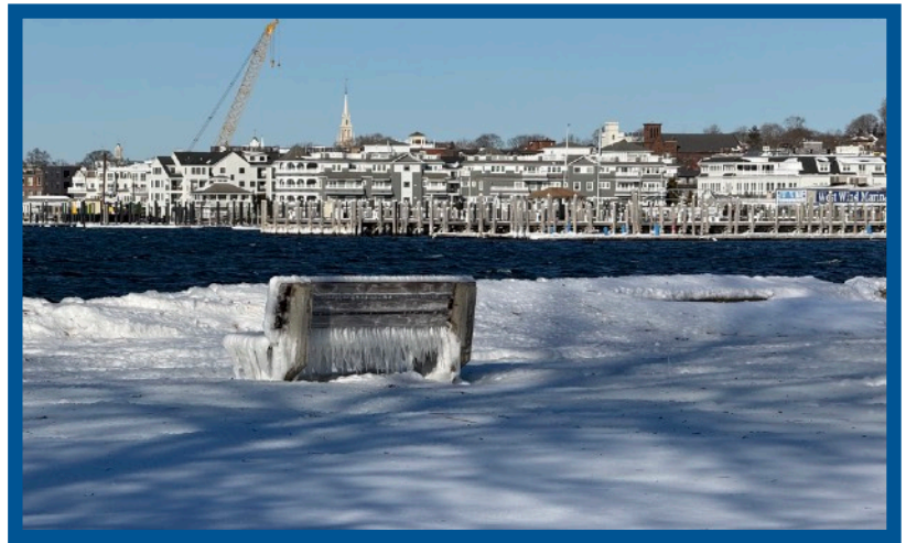
The harbor walk hasn't been very pedestrian friendly lately