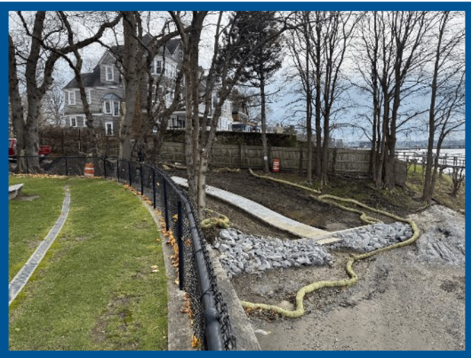
Pine St. Driftway under construction